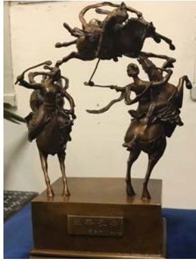
Silk Road Monument